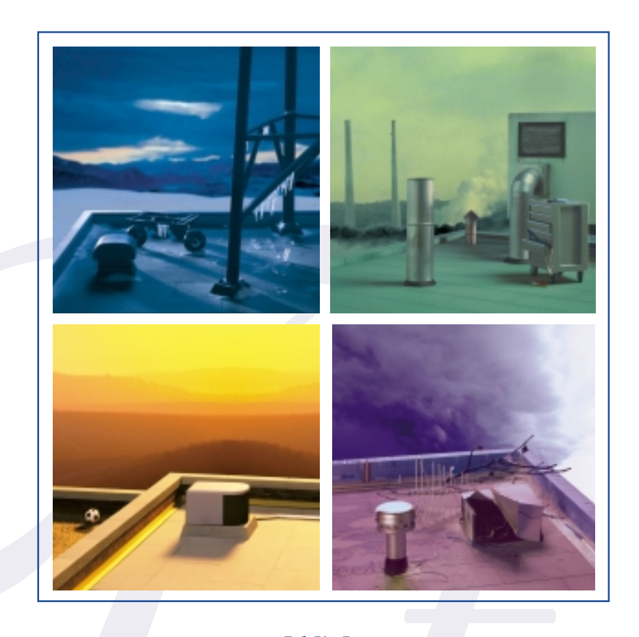
With Total Performance Warranties From T. Clear Corp.